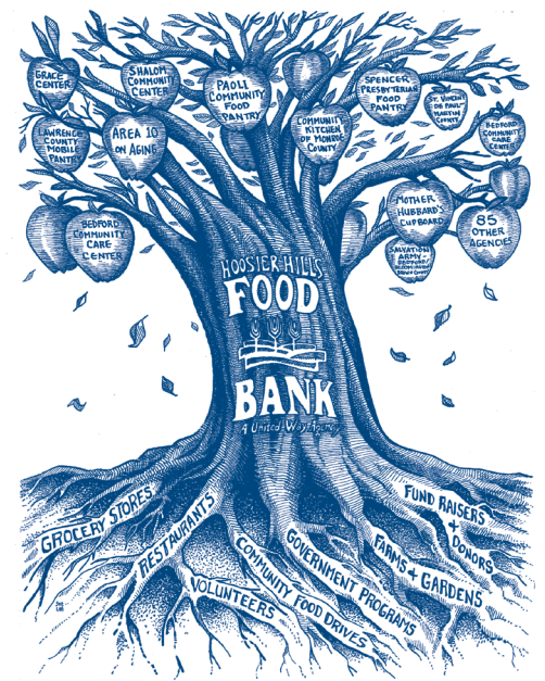
Joe Lee’s exceptional drawing debuted in HHFB’s annual holiday appeal and has been used to thank donors on cards and certificates.