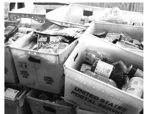
The NALC Branch 828 Stamp Out Hunger Food Drive tops the list again.