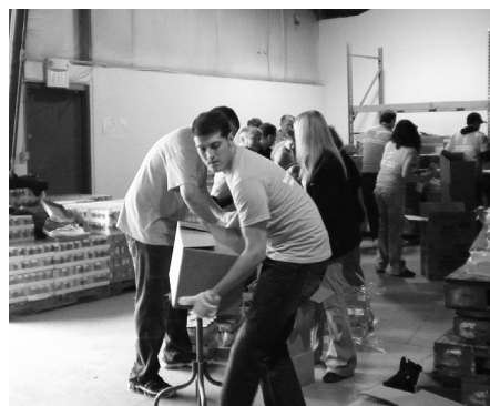
Over 100 Comcast Cares Day volunteers packed CSFP boxes, laid gravel, painted barrels and performed other tasks in April.