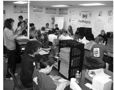
Martin Luther King Day volunteers prepare bags for the Live from Bloomington food drive.