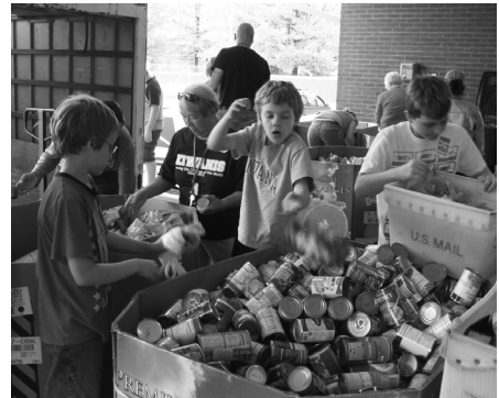
Young volunteers help sort cans from the Stamp Out Hunger food drive in May.

We celebrated our 28th birthday on November 18 as Bloomington Mayor