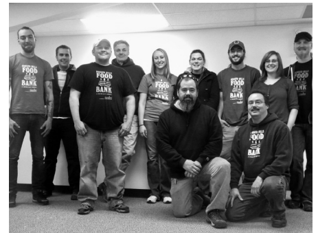
HHFB Staff, March 2011