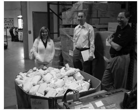
Representatives from Indiana Pork and Feeding Indiana's Hungry were on hand as HHFB received the first frozen pork donation from the Million Meals Program.