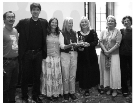
Volunteer members of the Soup Bowl Organizing Committee accept their award at the Hunger Recognition Reception.