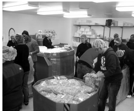
Martin Luther King Day volunteers pack bulk pasta for distribution to agencies.

The number of garden volunteers increased as 236 people put in over