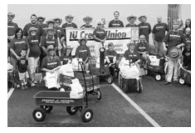
IU Credit Union volunteers show their support for the HHFB in the 4th of July parade.

wage, nearly $80,000, but the impact was even greater. Without the support of community volunteers it would be impossible to meet our goals and challenges.