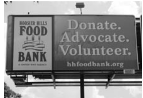
Lamar Advertising donated multiple billboards throughout 2009 to support HHFB.