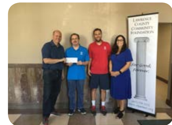
Accepting a donation from the Lawrence County Community Foundation