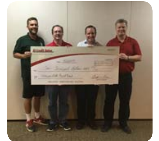
Accepting a donation from IU Credit Union