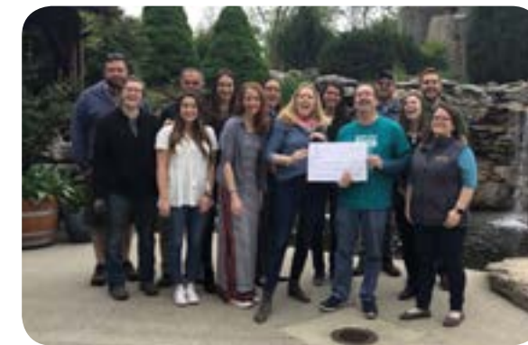
Accepting a donation from Oliver Winery

Altogether, we've raised $130,585 if you include our challenge, and we're closing in on the remaining $9,415 we need to meet that challenge and place our truck order. We're trying to raise these funds strategically because we still need the regular unrestricted donations that pay our bills, secure fresh produce and keep our other vehicles on the road. Stay tuned for more updates!