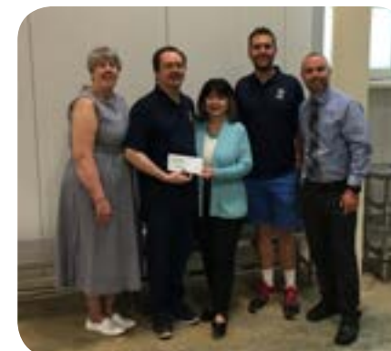
Accepting a donation from the John and Joyce Poling Fund of the Community Foundation of Bloomington and Monroe County